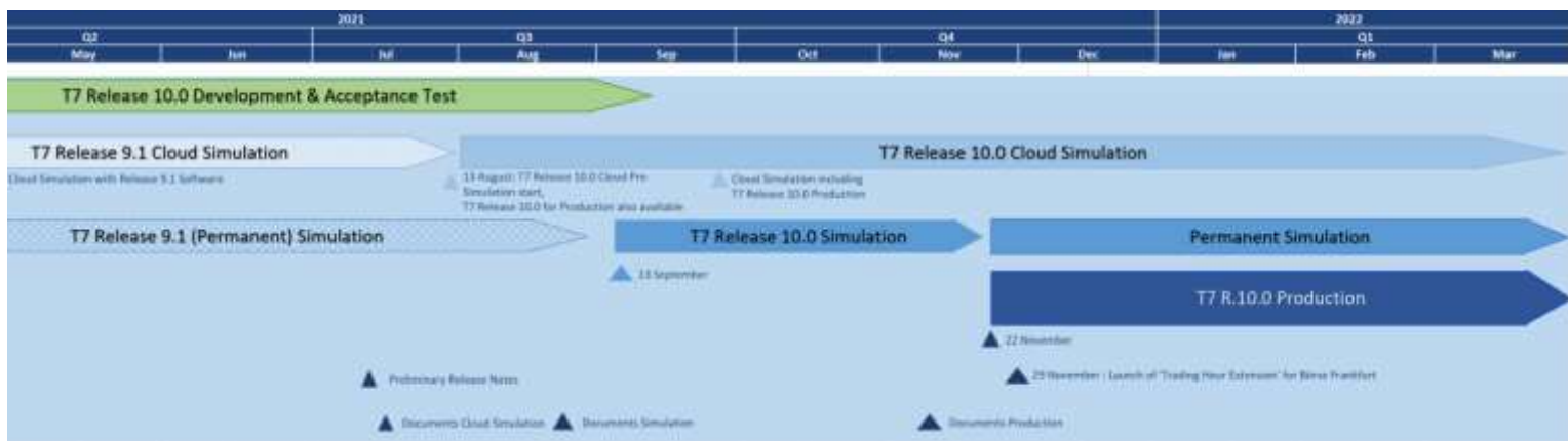
Figure 1: T7 Release 10.0 document publication and introduction timeline